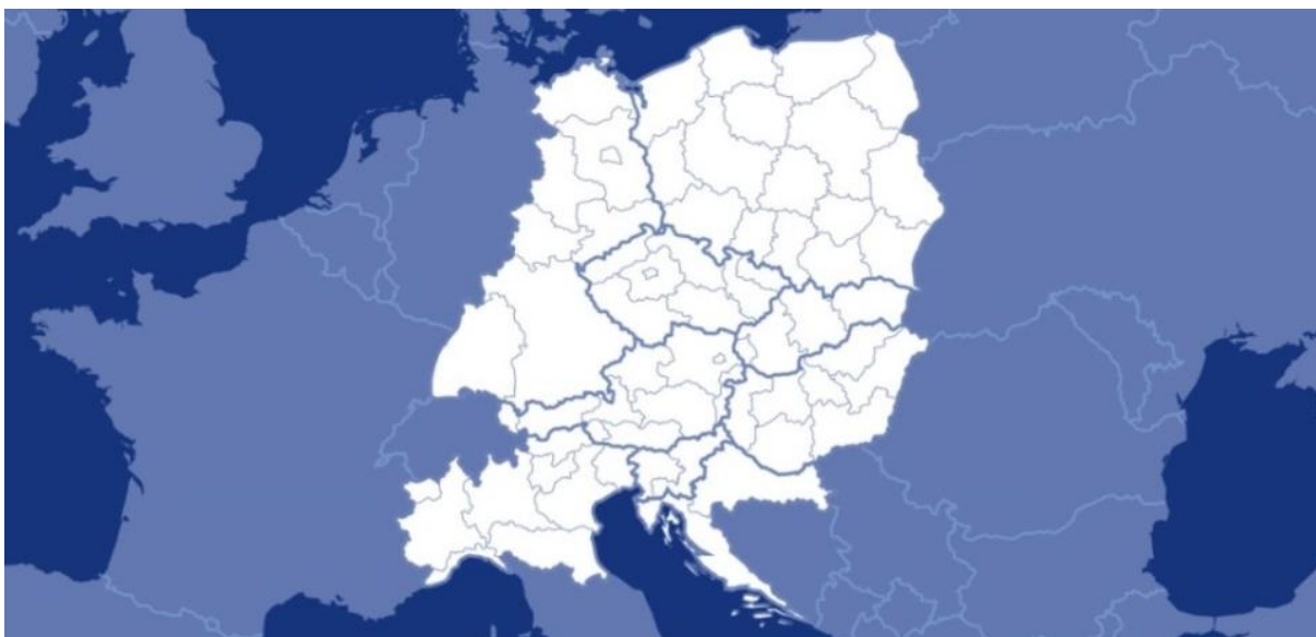
Figure 1: Programme area of Interreg CENTRAL EUROPE

The central Europe area is highly heterogeneous in geographical terms (marked by coastal areas, mountain ranges, rural areas, large urban agglomerations etc.) as well as in economic and social terms (exposing the lingering east-west divide). The programme area has a large number of assets